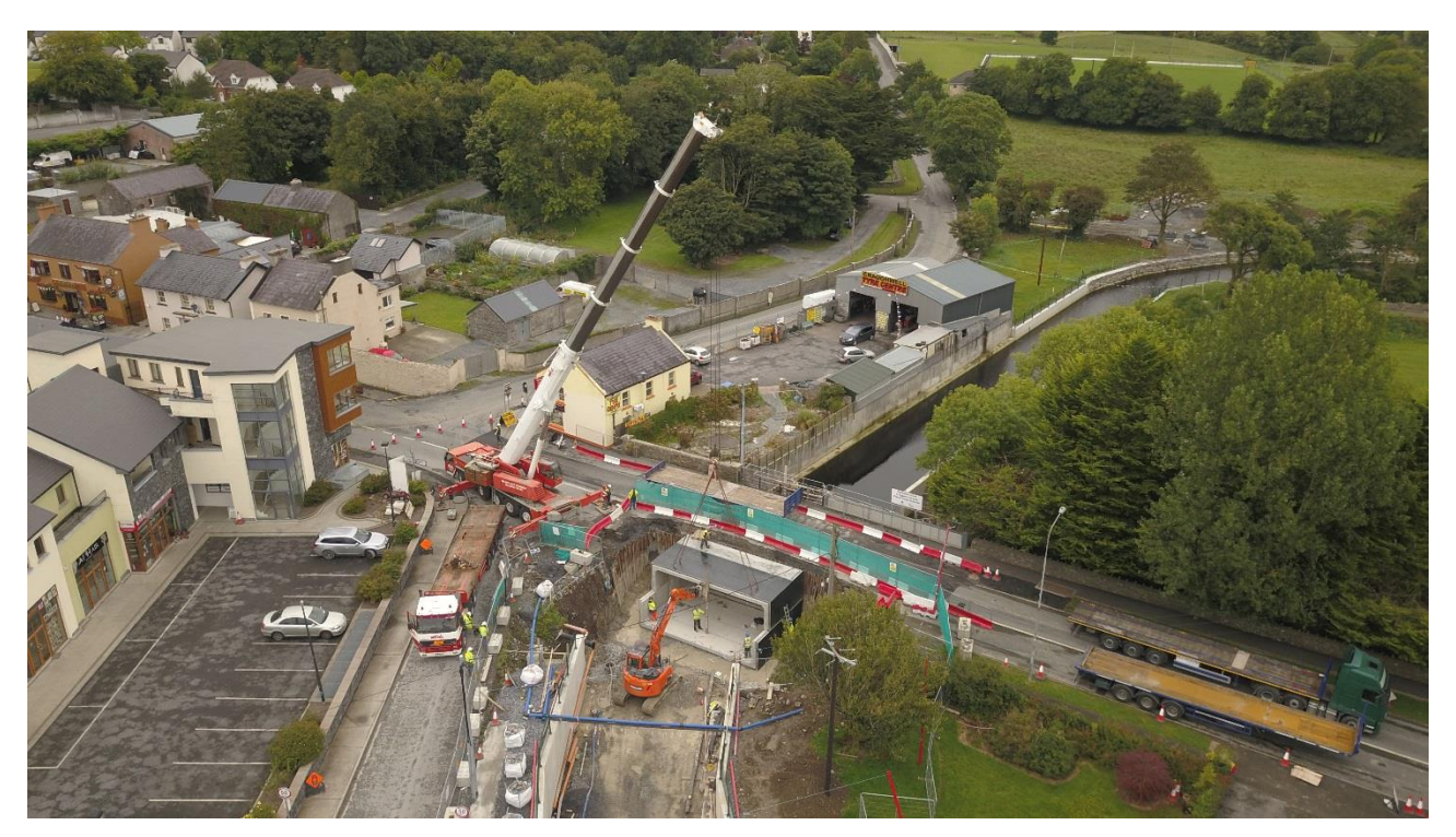
Figure 1; Aerial View of Bridge Replacement