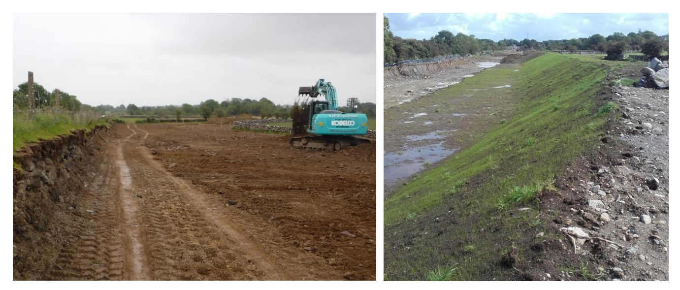
Figure 3a & 3b; Second Stage Channel Formation & Embankment Construction