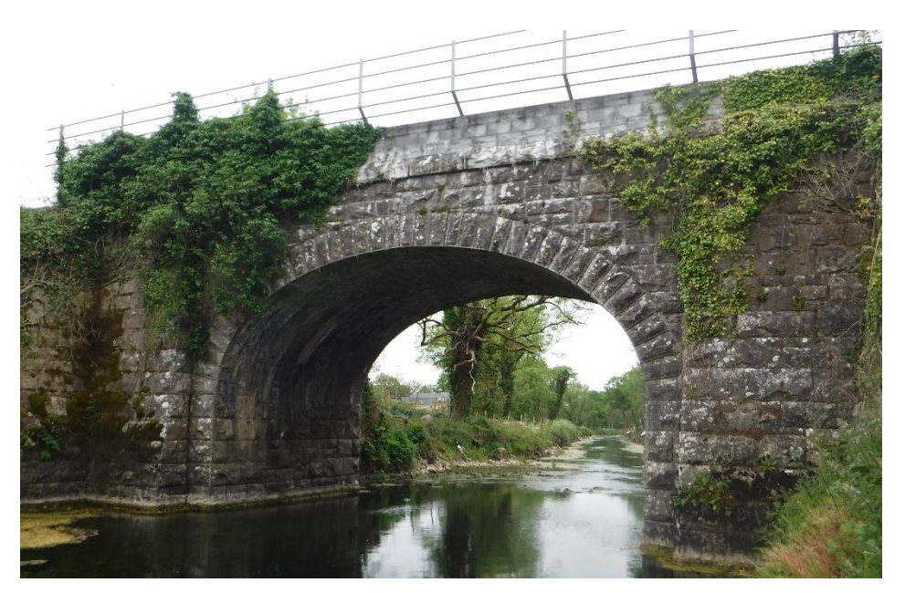
Figure 4; UB154 Railway Bridge